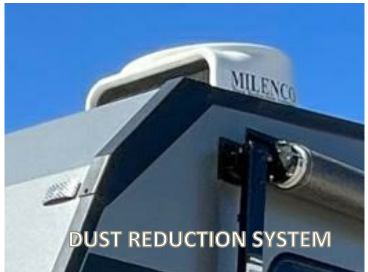
DUST REDUCTION SYSTEM