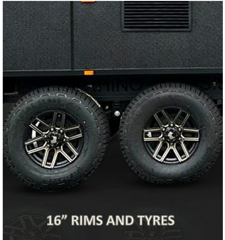
16" RIMS AND TYRES