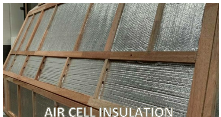
AIR CELL INSULATION