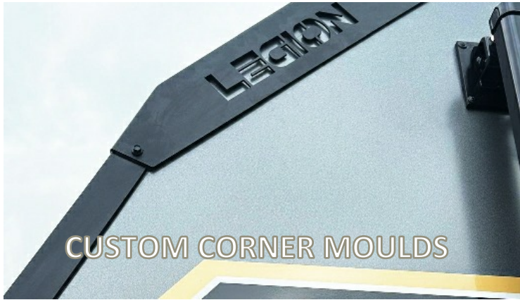
CUSTOM CORNER MOULDS