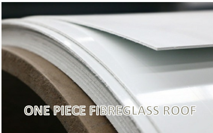
ONE PIECE FIBREGLASS ROOF