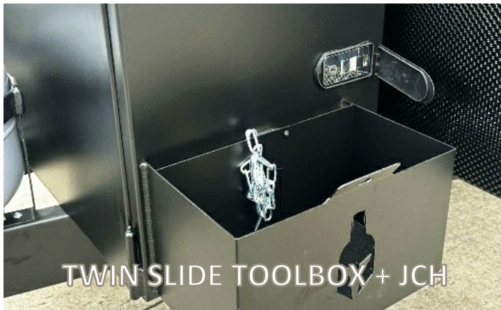
TWIN SLIDE TOOLBOX + JCH